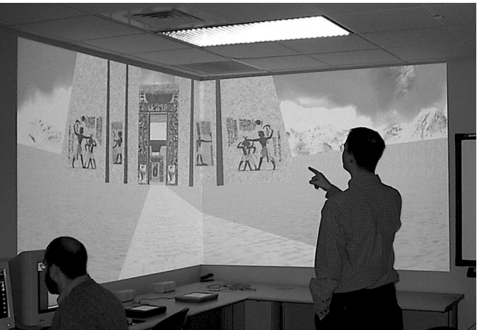
Figure One: The display of a very simple V-Cave. The man in the foreground is in the ideal viewing location. The virtual environment he sees (VAE 2002) was authored by several researchers as an educational tool.

CaveUT is a set of software modifications which allows UT to support a multi-view display with off-axis perspective correction, making an integrated multiscreen display possible. Unreal Tournament is partially open-source and programmable. It supports the authoring of complex virtual worlds, fundamental changes in game behavior (i.e. different physics), artificial intelligence and control of virtual actors from an external program.